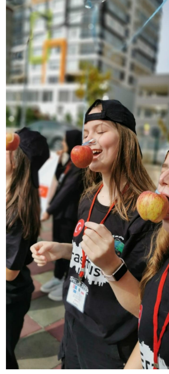
It is not so easy, however they are having great fun..